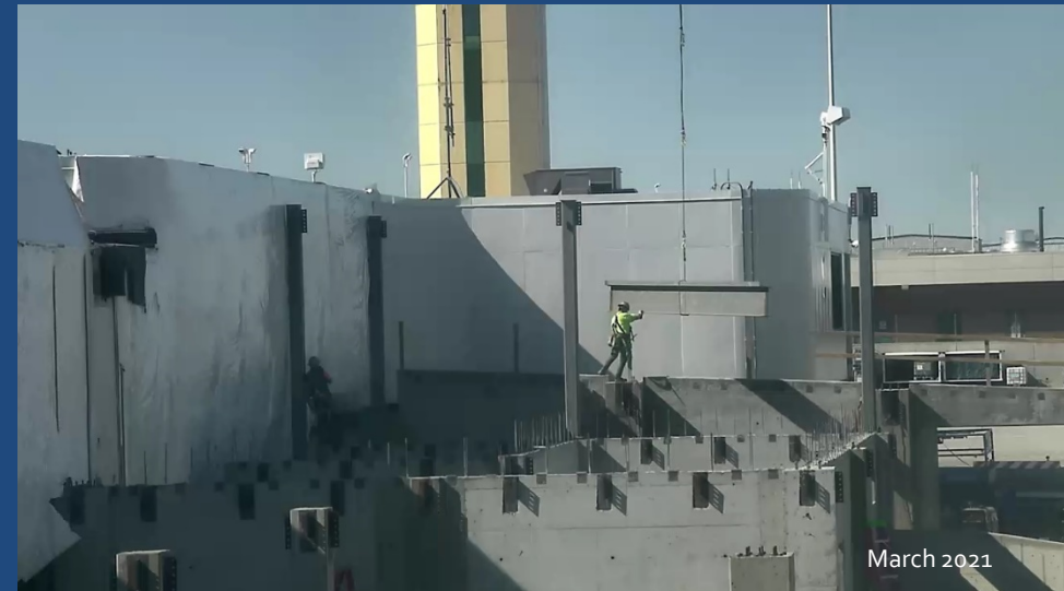
Steel I-beam installation for roof and support columns.