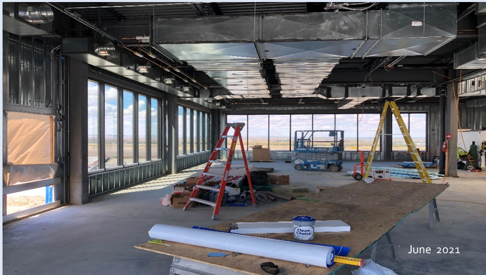
New freight elevator and Gate A 4 holdroom.