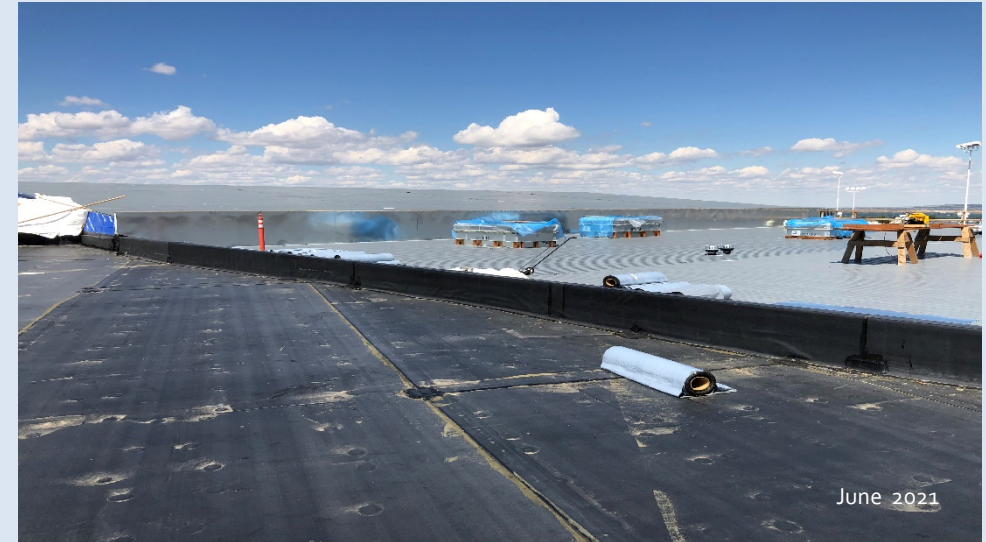
Skylight and surrounding roof work.