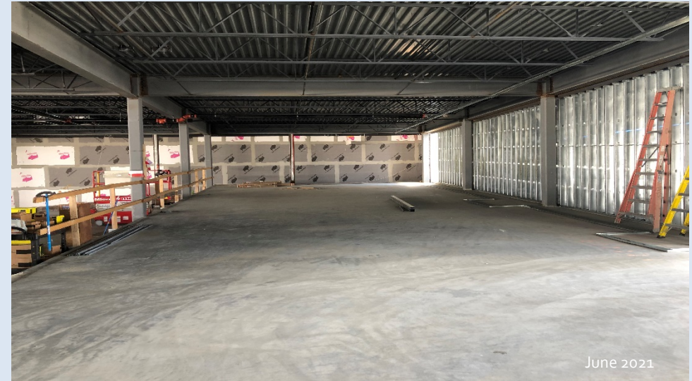
Interior view of new exit from Concourse to baggage claim.