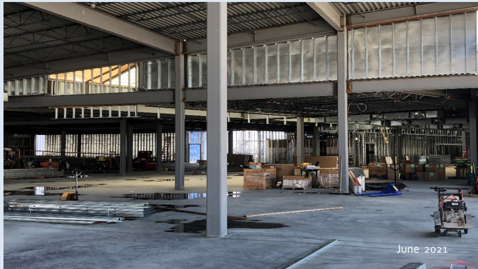
Interior view of seating area in front of the new fireplace.