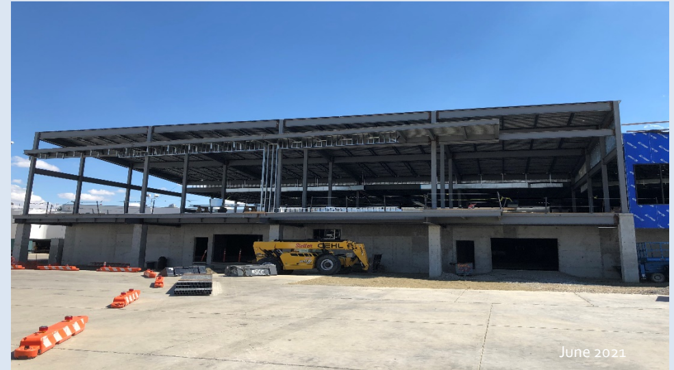
View of new Great Room from aircraft parking ramp. Large windows will provide a lot of natural light.