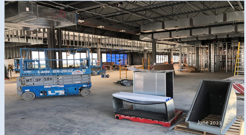
New Gate A 3 holdroom.