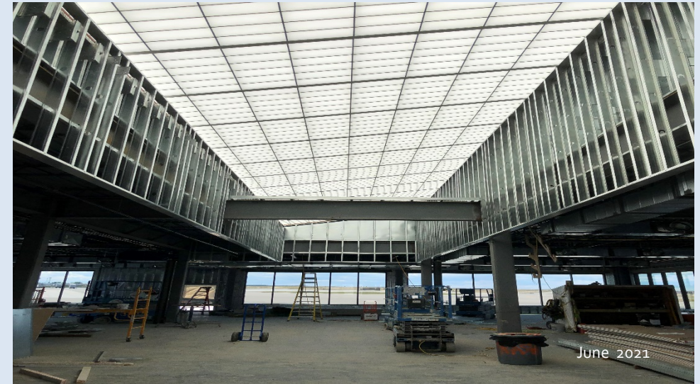
New skylight that spans the length of Concourse A to provide a lot of natural light.