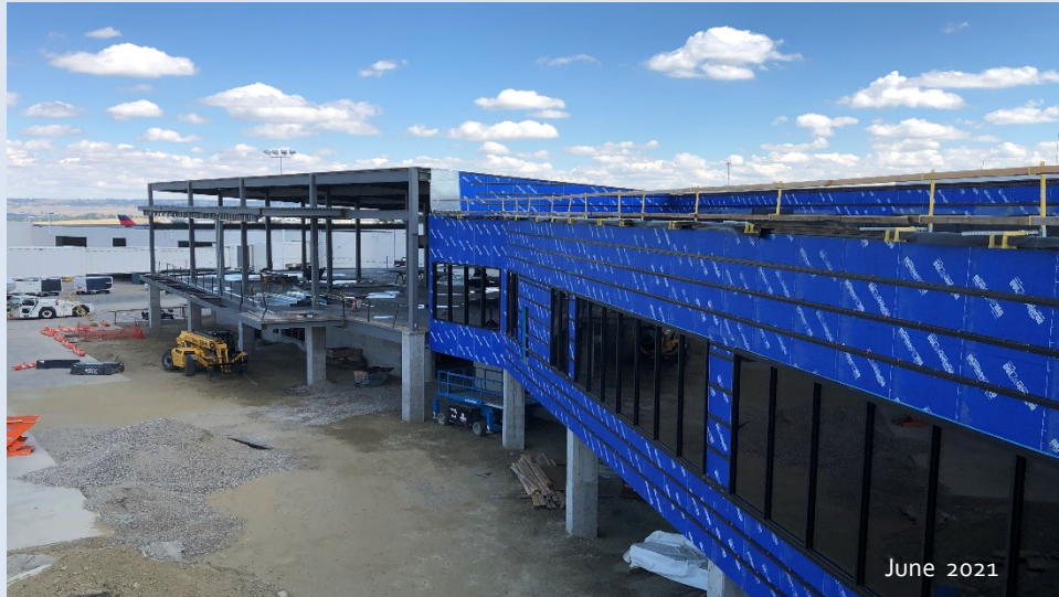
Exterior view of new Great Room and Gate A1.