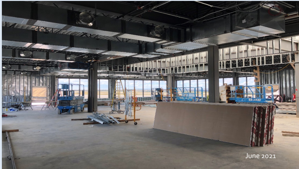
New Gates A 3 and A 4 holdrooms – HVAC work is being completed.