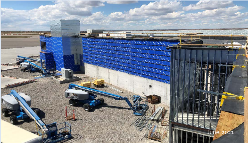
Blue Skin insulation and tracks to hold the exterior siding in place.