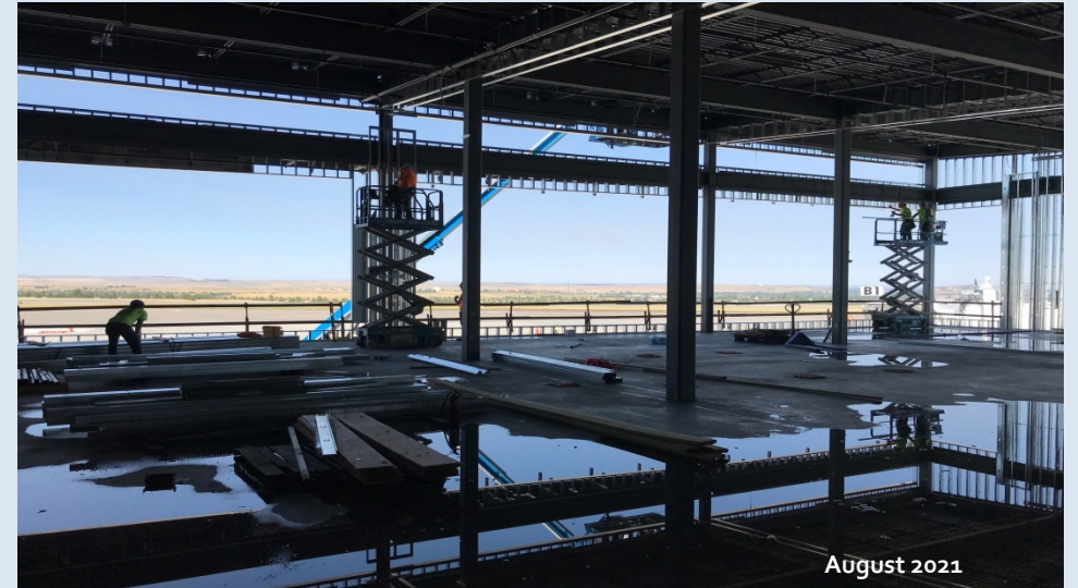
Framing the Great Room.