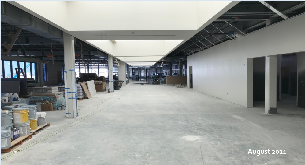
Walkway under skylight and entrances to new restrooms.