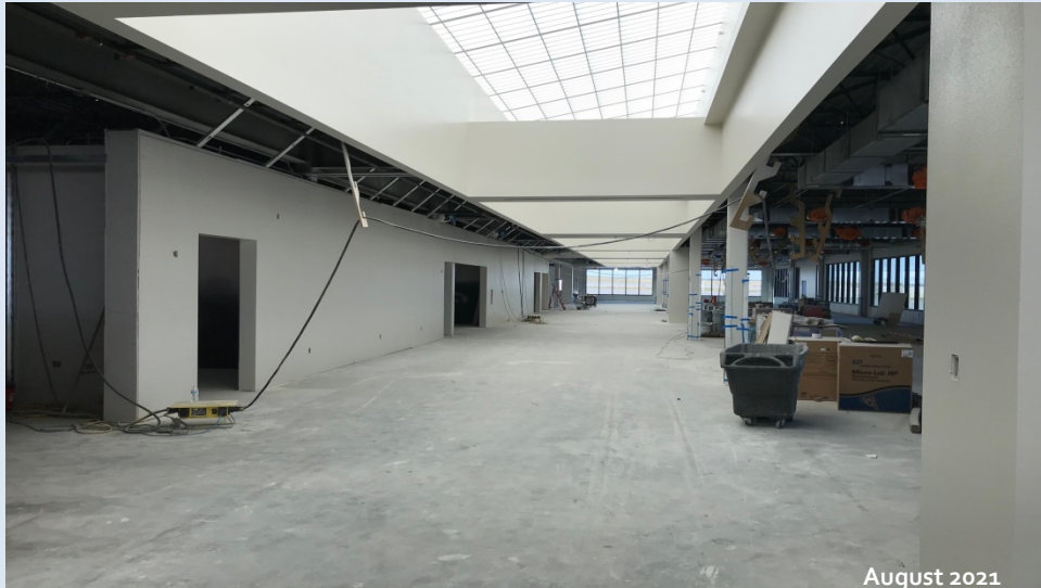
A Concourse walkway under the skylight.