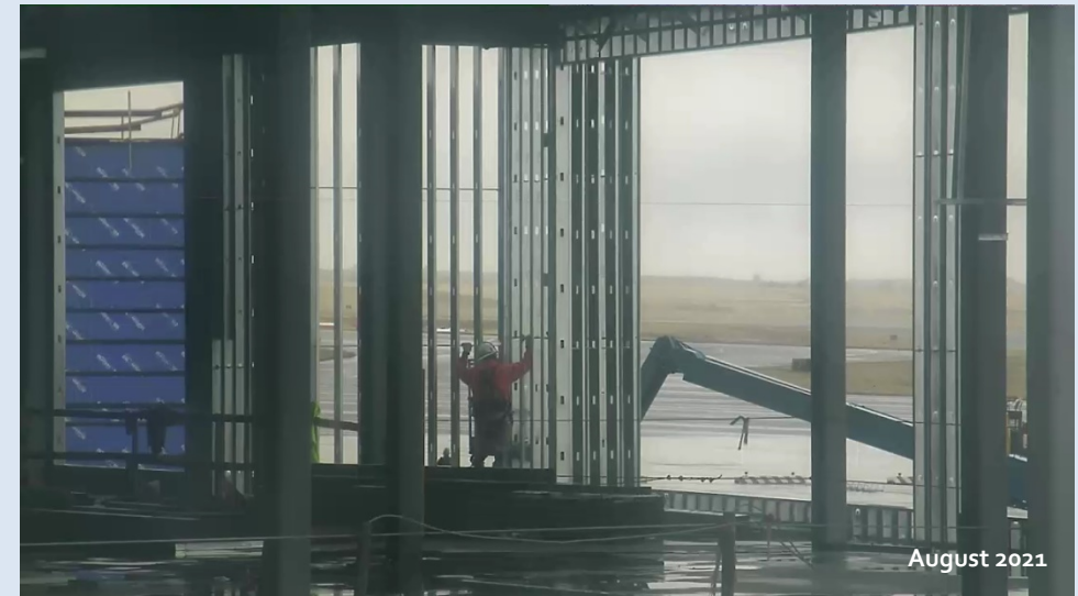
Framing for windows is underway.