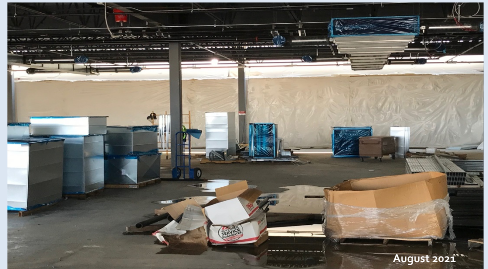
New TSA screening area under construction.