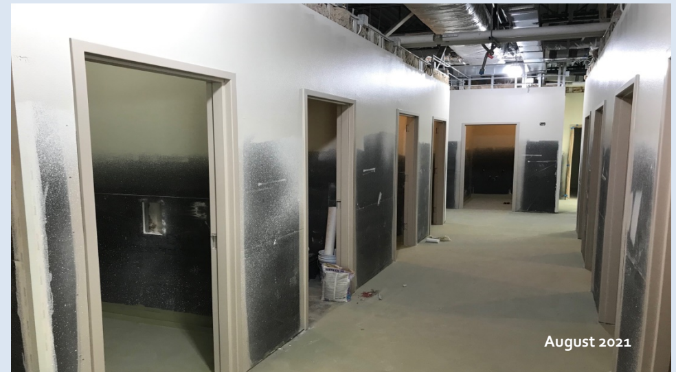
Concourse A new restrooms.