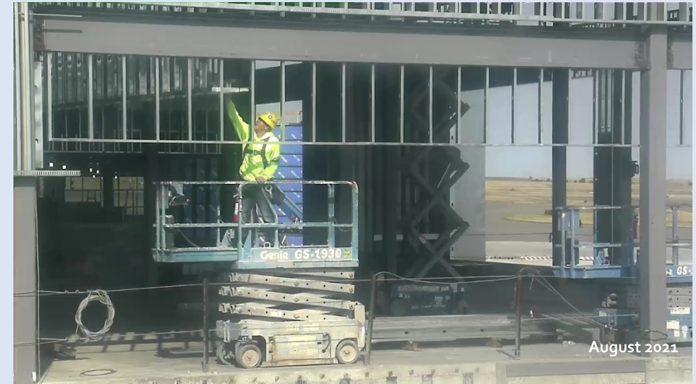
East wall of the Great Room under construction.