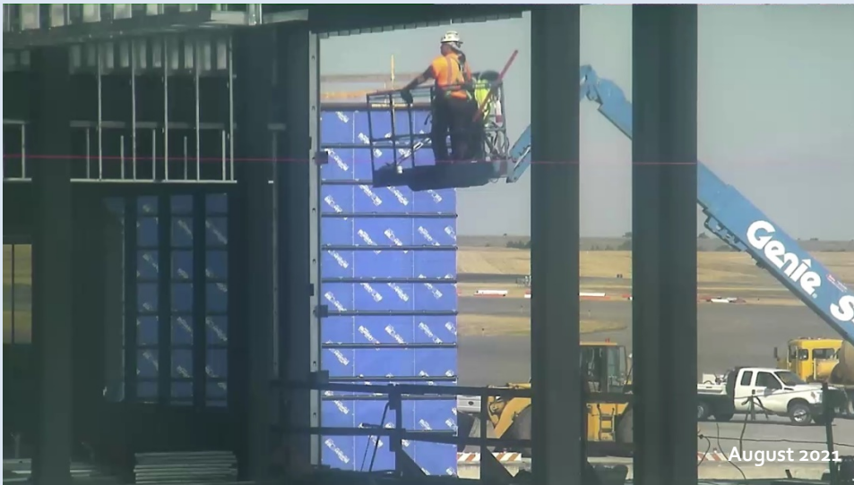
Exterior siding being installed.