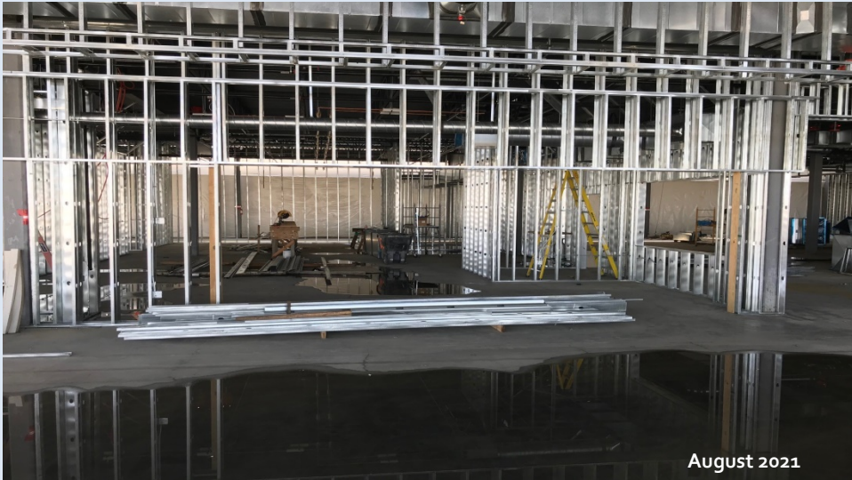
Gift shop under construction.