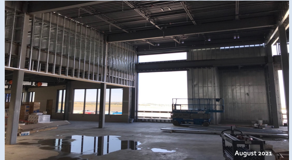
Fireplace wall and viewing window.