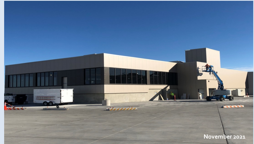
Gate A 4 – exterior work nearing completion.