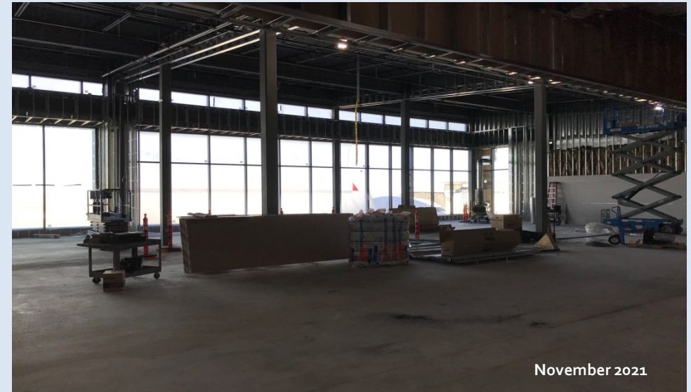
Great Room – Bar/Lounge Area.