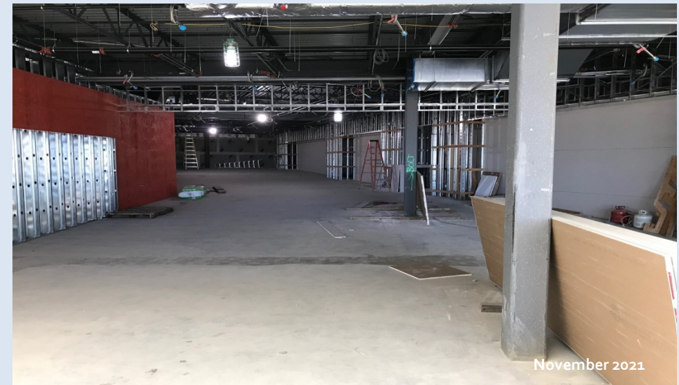
Left Photo: Fireplace in Great Room. Right Photo: Exit Lane Area.