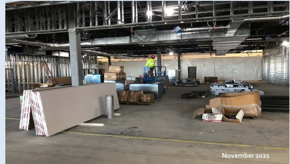
TSA Screening Area.