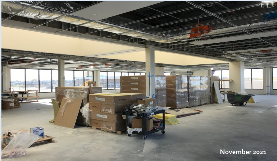
Gate A4 Area.