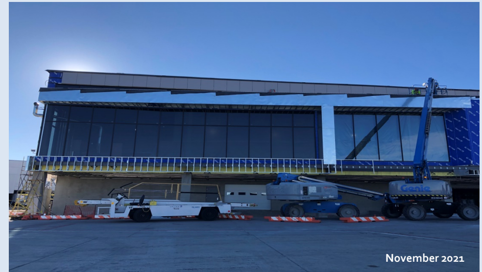
Exterior work on the Great Room.