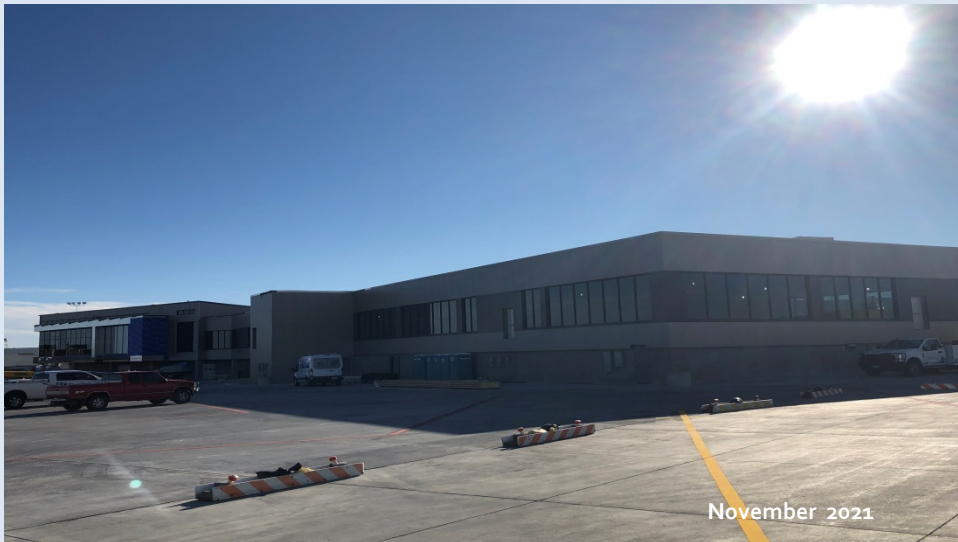
Gate A 3 – exterior work nearing completion.