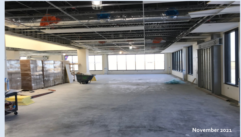
Gate A 3 Area.