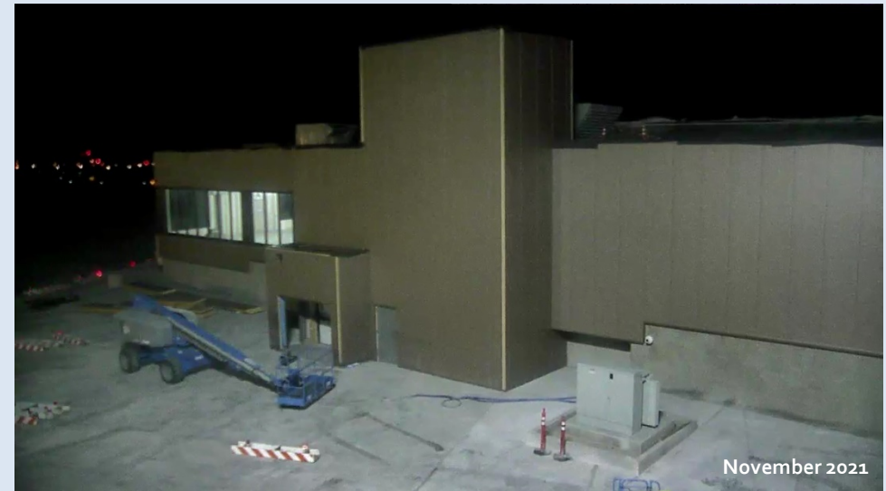
Evening view – siding installation completed.