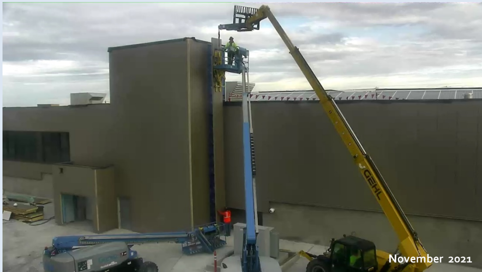
Last siding panel on this side being lifted into place.