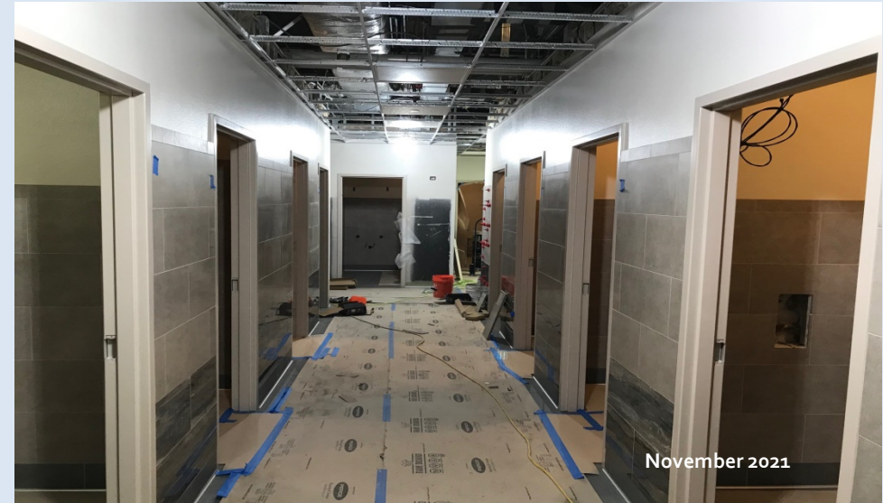
Expanded View of Bathrooms.