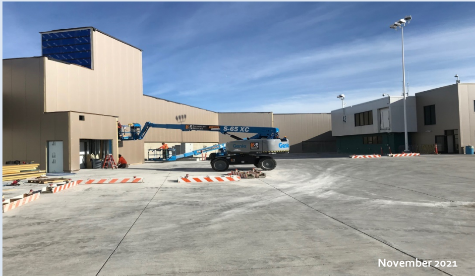
Exterior – South View.