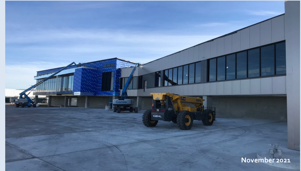
Exterior – North View.