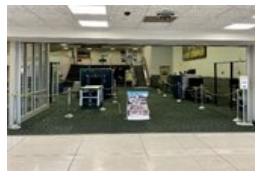
Former TSA Screening Area

The TSA screening area now has a new home on the second floor.