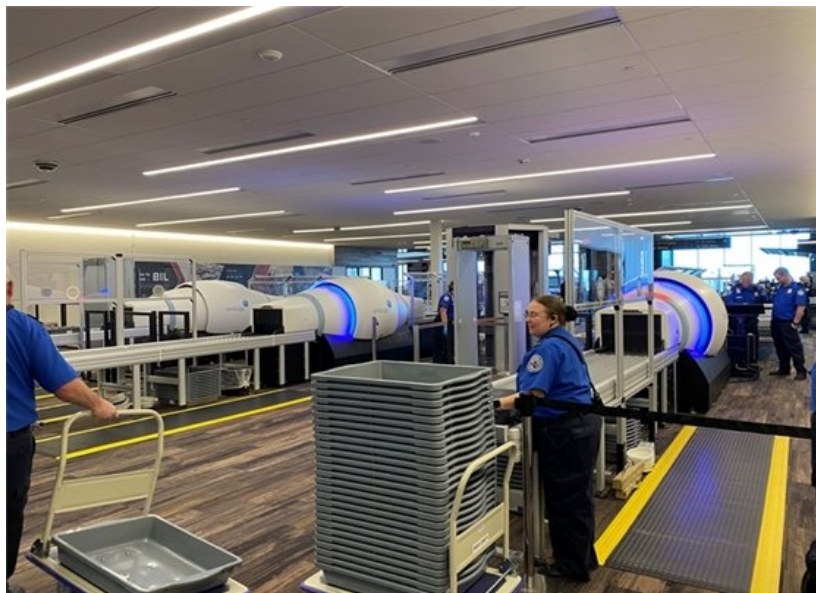
New TSA Screening Area with Enhanced Equipment

Starting the week of November 6, travelers will be met by a construction wall at the old screening area. So instead, they'll need to go through Logan's Diner to reach TSA. There will also be a ramp in place to access the route through the restaurant.